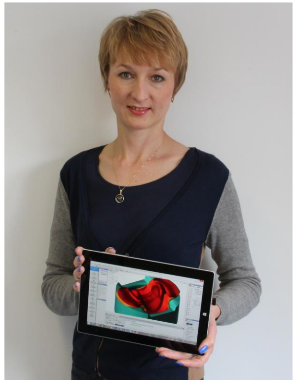
Figure 1. A tablet running QForm V8 Cloud

The cloud solution is very flexible and scalable. You just have to install QForm V8 Cloud on your computer or tablet with Windows 8 (Fig 1). This program is identical to standard QForm V8 except that it has no simulation core. It can work in two modes: either connected to the server (on-line mode) or not connected (off-line mode). In the latter case you can prepare a new project for simulation and playback the results of previously run files. To run the simulation you should be on-line!